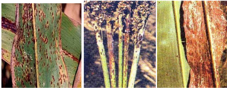
Symptoms on leaves and stalk

The fungus affects the crop at all stages of growth. The first symptoms are small flecks on the lower leaves (purple, tan or red depending upon the cultivar). Pustules (uredosori) appear on both surfaces of leaf as purplish spots which rupture to release reddish powdery masses of uredospores . Teliopores develop later sometimes in the old uredosori or in telisori, which are darker and longer than the uredosori. The pustules may also occur on the leaf sheaths and on the stalks of inflorescence.