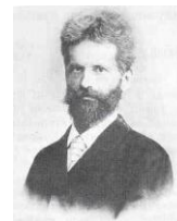
Haberlandt, G – Father of plant tissue culture

1902- Haberlandt, G – Father of plant tissue culture published a paper on "Experiments on the culture of isolated plant cells: In that he says "I should like to point out the fact that, in my cultures, despite the conspicuous growth of the cells which frequently occurred, cell division was never observed. It will be the problem of future culture experiments to discover the condition under which isolated cells undergo division". He clearly set forth the purposes and potentialities of cell culture after having attempted and failed in the culture of isolated plant cells. The reasons for his failure may be (i) use of three monocotyledonous genera for much of his work, (ii) culture of mature differentiated green mesophyll and pallisade tissues, (iii) contamination during culture growth.